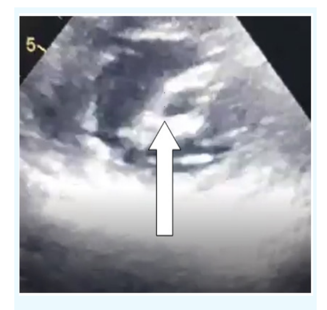
Figure 2: 2D-TTE short axis: mitral orifice stenosis

The two mitral commissures were fusedand the sub-mitral valve was retracted.