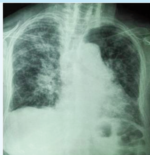
Figure 1 : Chest X-ray showing bilateral and diffuse interstitial and alveolar opacities.

The treatment consisted on stopping using amiodarone, oxygen with 3 to 4 l/min with nasal cannula, and systemic corticosteroid (prednisone 1mg/kg daily). The patient showed a good response after 48hours of treatment, and was discharged home two weeks after with prednisone use over three months. Pulmonary computed tomography performed one month after, showed significant improvement of images with disappearance of pleural effusion and very important reduction of alveolo-interstitial opacities (Figure 3)