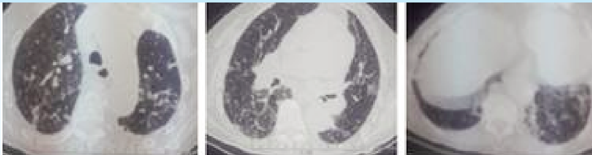
Figure 3 : Pulmonary computed tomography after one month of corticosteroids with significant improvement of images: disappearance of pleural effusion and very important reduction of alveolo-interstitial opacities