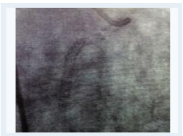
Figure 1: a complete linear transverse fracture of the stent in the proximal right coronary artery.

The angiographic control didn't show any thrombosis but a complete linear transverse fracture of the previously inserted stent (Figure 1).