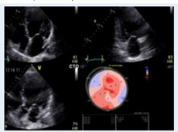
Figure 2: Echocardiographic findings: left ventricle dysfunction with abnormal speckle tracking of the midventricular regions and normal apical region.

examination. Cine view showed midventricular akinesis. There was no edema on T2 weighted images short-inversion-time, inversion-recovery (STIR) or pathological signal activity in the late-enhancement sequences, which rouled out myocardial infarction or inflammatory processes (Figure 3). During the following days the patient showed a progress and on the sixth day she breathed spontaneously after extubation.